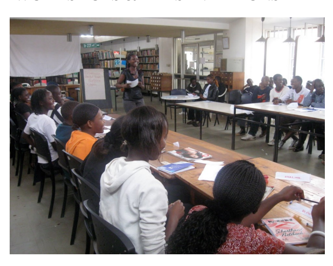
COMMUNITY & CULTURAL EVENTS